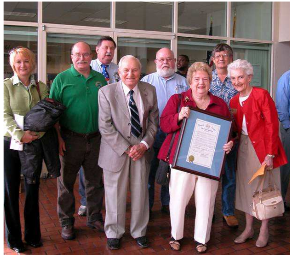
Resolution Ceremony on December 16, 2008.